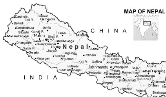
Figure 1: Map of Nepal